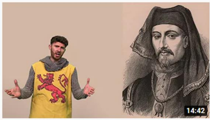
Owain Glyndŵr - Children's Festival of Welsh History 1.1K views • 9 months ago

When he died in 1604, Bishop William Morgan, was a poor man, who left in his will some pewter crockery, five flower pots, two peacocks and two swans. He also left the nation a priceless treasure – a Welsh translation of the Bible.