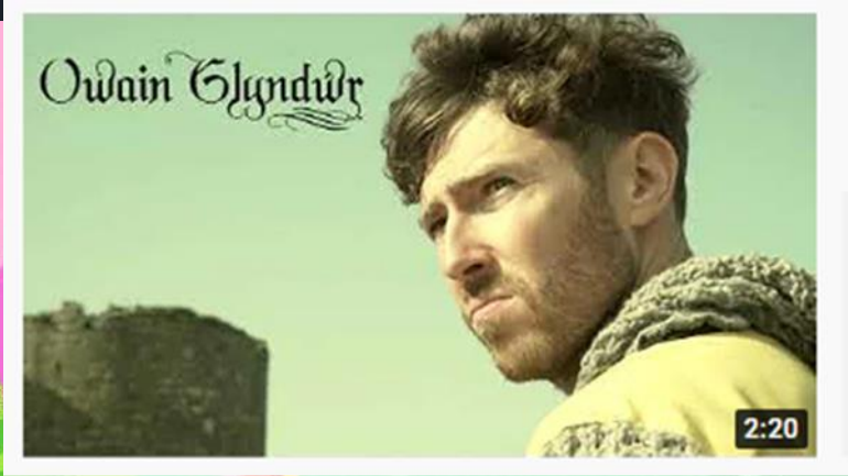
Owain Glyndŵr Day - Children's Festival of Welsh History 2.3K views • 1 year ago