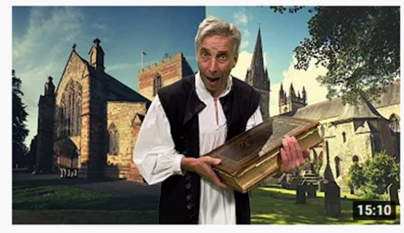
Bishop William Morgan - Children's Festival of Welsh History 115 views • 9 months ago

After years of oppression by the Marcher Lords and the English crown, one brave Welshman decided enough was enough.