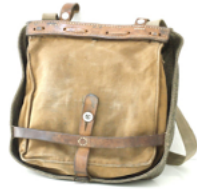
Carrier bag: £7.99