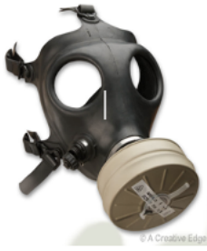
Gas mask: £89.50