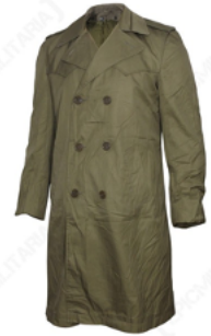
Light trench coat: £19.87