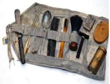
Wash kit: £6.45