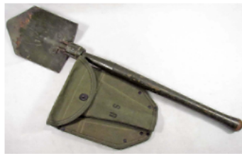
Entrenching tool: £12.35