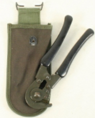
Wire cutters: £8.92