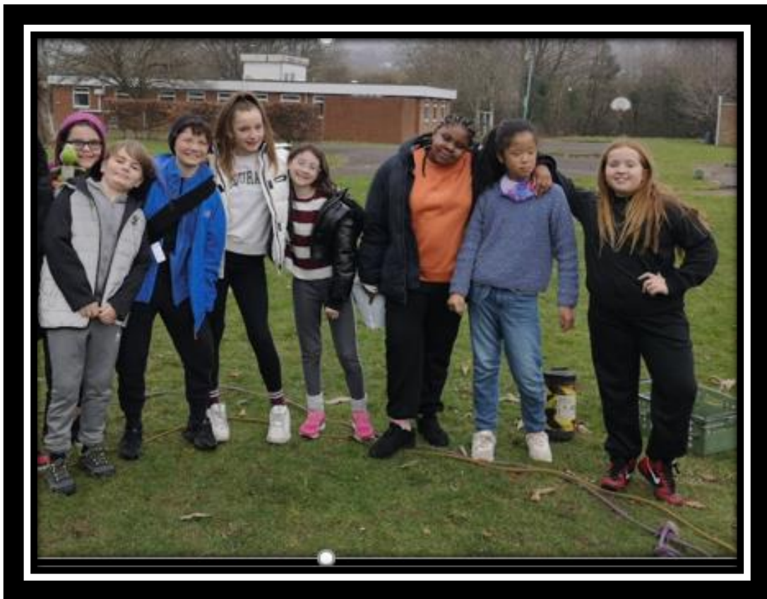
Y6 trip to Gilwern Outdoor Centre (February 2023)

Governors are kept fully informed. Communication with parents is effective, open and informative. Most pupils with ALN make strong progress or better.