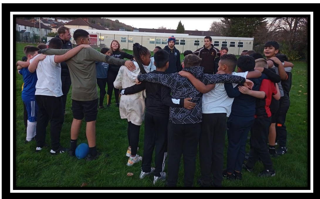
Joint rugby training - Somerton and Eveswell on the Somerton playing field

Swimming instruction was scheduled for our Y3 Pupils and they enjoyed this in the summer term. The children did exceptionally well and definitely benefited from these sessions.