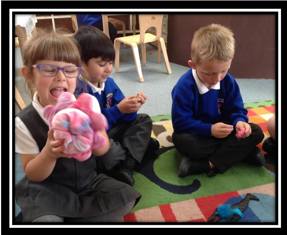
Nursery pupils enjoying a 'touchy, feely experience' exploring textures